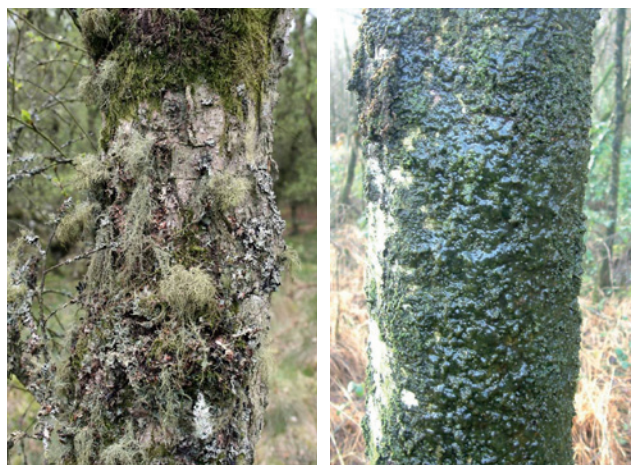
Ammonia can kill tree-living plants (left), replacing them with algal slime.

Experience shows that regulatory or financial drivers are needed to ensure such technologies are used. Changes need not be uneconomic. The Netherlands and Den-